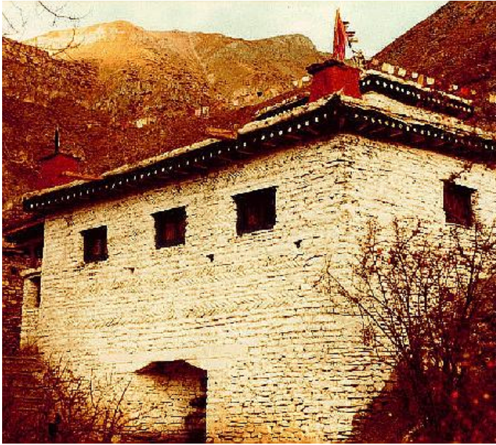
The “Temple Of Miraculous Fire” at Muktinath, Nepal.